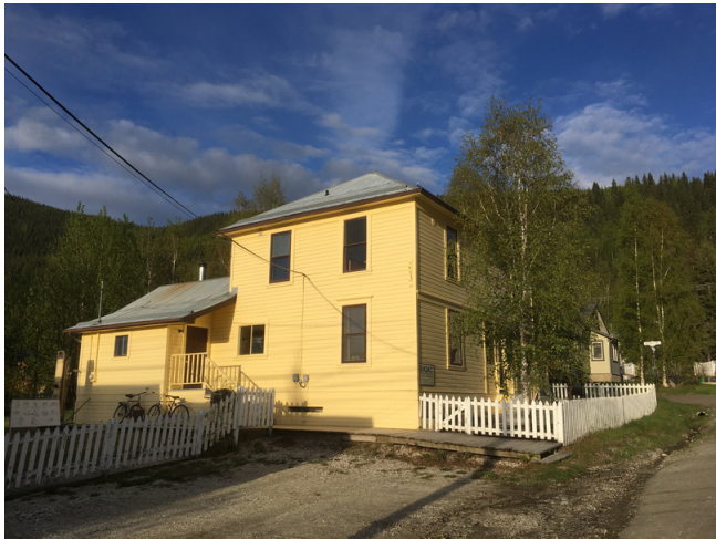
PARKS CANADA'S MACAULAY HOUSE

As most people know Macaulay House is on the disposal list of Parks Canada's assets, so we may lose it as a location. It has been a great facility over the years and Parks Canada has been a wonderful partner. The residence program is a flagship program of KIAC, getting us notoriety far outside the Yukon and is important to KIAC. We are currently looking at many different options to continue the program including other locations with Parks Canada. While the program may look different in the future, KIAC is committed to having an artist in residence program.