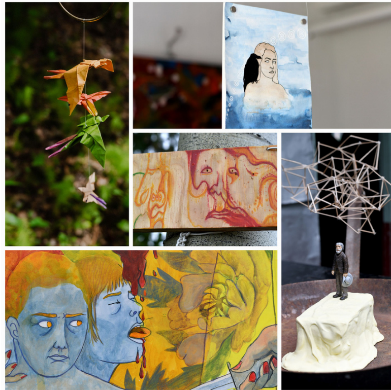
INSTALLATIONS, VARIOUS ARTISTS

The decision to change the festival dates to the beginning of summer proved successful, providing favorable weather conditions and increased attendance. This format allowed participants to explore more outdoor activities and venues. The community embraced this change, and the plan is to continue with this schedule in the future.