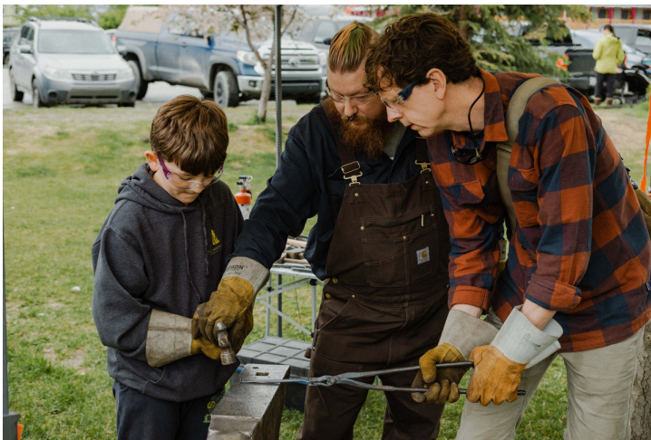
YUKONSTRUCT BLACKSMITH DEMO

YRAF 2022 brought back activities on the waterfront Riverside Park in full force. The event featured a hands-on demonstration tent, an artist market, a live music stage, a kids tent, and numerous interactive activities. Visitors enjoyed the centralized location of exhibits and the vibrant atmosphere at the riverside. The Gallery Hop, which facilitated exploration of various unconventional art spaces and offered a spotlight for emerging local artistic talent, made a successful comeback as the signature kick-off event.