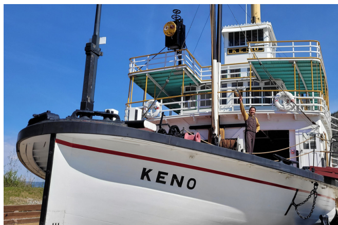
PARKS CANADA S.S. KENO INSTALLATION SITE & MUSIC STAGE

This partnership coincided with the 100th anniversary of the S.S. Keno, which served as a venue for amazing art exhibits and concerts. The festival celebrated this historic milestone by integrating captivating art installations within the site, paying homage to its rich heritage.