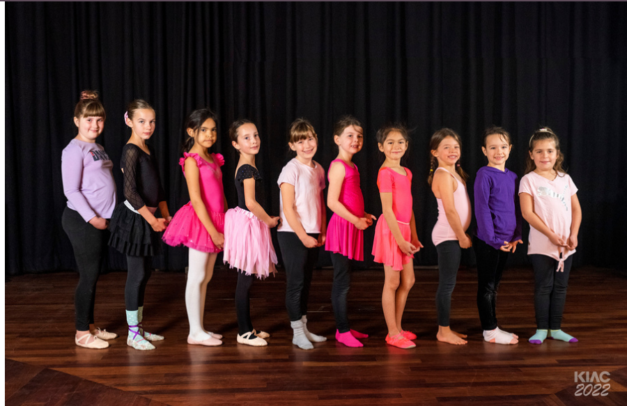
KIDS BALLET 2022