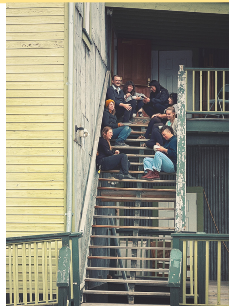
KIAC STAFF