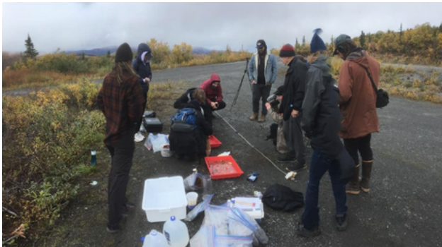
PHYTOGRAMS ON THE TOP OF THE WORLD HIGHWAY FILM LAB 2022

During the summer we held a series of well attended screenings by Yukon filmmakers aimed at the tourist market.