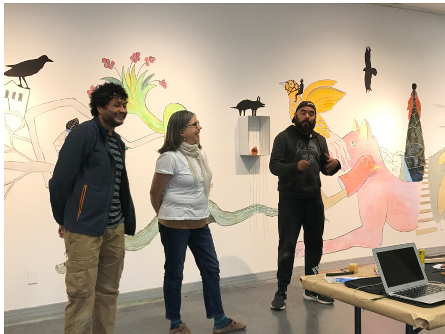
Z'OTZ COLLECTIVE ARTIST TALK