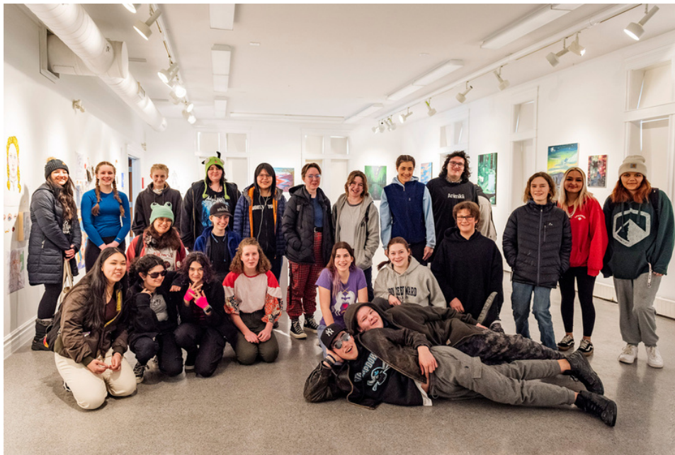
YOUTH ART ENRICHMENT CLASS OF 2023

After a hiatus in 2021 and reduced day-camp model in 2022, we are pleased to have presented an overnight program in 2023 with three exciting course options, excellent meals, lots of scheduled extra-curricular activities such as button-making and volleyball, in addition to a student-led tour of SOVA. The week ended with a well-attended student exhibition in the SOVA gallery. Participant and instructor feedback was fantastic and overall the program was a success.