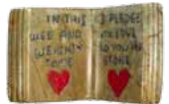
Patty Jackson Symptoms of Cabin Fever 4 soapstone carvings