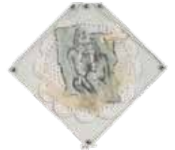
Leslie Leong La Femme mixed media