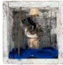
Veronica Verkley Fathom motor, found objects 2015 * press button to play