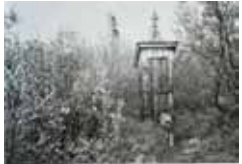
Christine Fuller Cold Storage, King Solomon, April Fires 3 B&W photographs 2015 Temporary reprieves from the elements