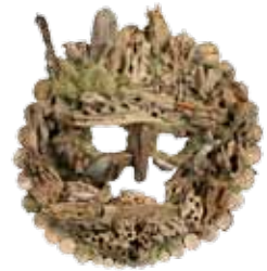
Erica Barta Mask wood, moss 2015