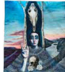
Rachael Siminovitch Latitude 64° watercolour on paper 2014