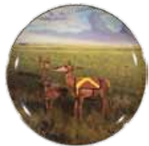
Bill Burns Safety Gear for Small Animals Plate plate 38 of 72