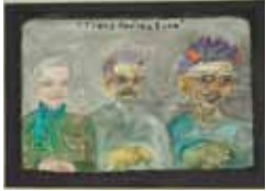
Joyce Caley 3 Stages of Serious Cabin Fever oil pastel, water pastel 2014